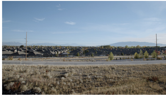
The landscape of Lehi, UT.