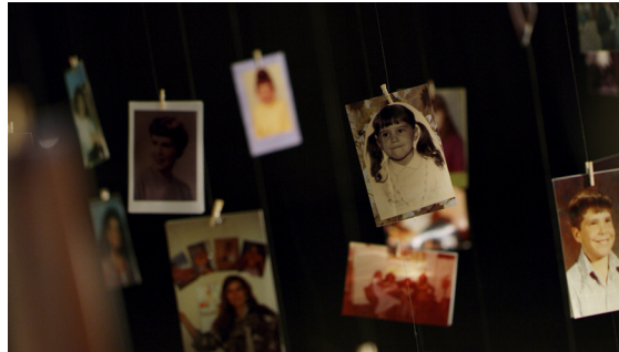
No Crime in Sin's title sequence features archival photos of the Johnson family growing up.